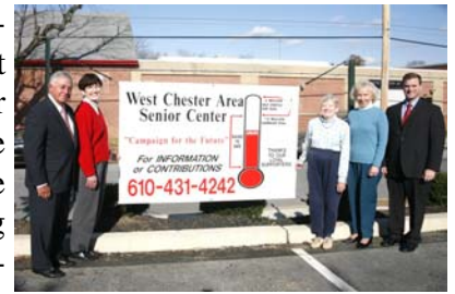
Staff and volunteers mark the Senior Center's milestone of $1 million dollars in their capital drive.

nity. For more information about the West Chester Area Senior Center, please visit the Senior Center webpage at www.wcseniors.org or call the center 610-431-4242. The Center is open Monday, Wednesday and Friday - 8am until 3pm and Tuesday and Thursday 10am until 3pm.