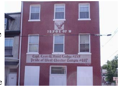
Captain Levi M. Hood Elks Lodge #159, located on East Market Street

Many years later my four children were members of the Elks Drill Teams. We spent many Saturdays marching in Philly, Reading, Pottstown, Coatesville, and Chester on Mother's Day. The excitement and energy was still there. I was proud to see the legacy continue. I say thanks to all of the Elks parents and volunteers that gave selflessly to those kids and got them to and from parades safely. All the behind the scene turmoil and confusion during the many hours of preparations melted into the background when those kids hit the street. We must continue to beat the drum, beat it loud enough to wake the spirits of every Elk that walked through the doors of the Elks Home. We must continue to march as a symbol of hope for the next generation youth in our community. Thank you for this Community Service Award. It is an honor to accept and I hope it signals a community that once again is on the rise!