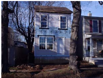
Picture of home under construction at 427 East Barnard