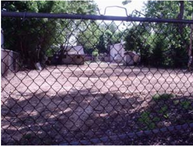
A view of the newly acquired Habitat property from Worthington Street.

On December 20, 2005 Habitat for Humanity of Chester County (HfHCC) went to settlement on 9 parcels of land located in the East End. This acquisition has been nearly 3 years in the making with the exceptional cooperation of the M.H. Davis Estate Oil Co. There had some delays along the way on both sides, but they eventually got resolved to allow the settlement to finally occur.”